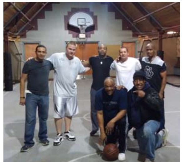
Group of guys from a local mission use our gym regularly to play basketball.

Elder Miller placed in nomination the following names for Congregational