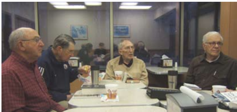
Men's Bible Study.

While some groups may complete their purposes and close, some plan to contin- ue in 2013. We hope new groups will form and new leaders emerge in 2013.