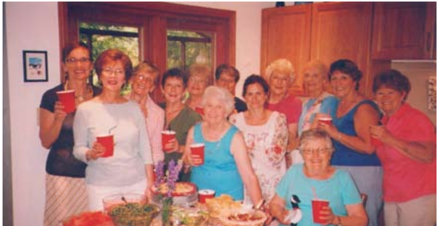
Monday night ladies Bible Study.

The Thank Offering supports creative and health ministries selected by national PW. In 2012 the thank offering was $909.39.