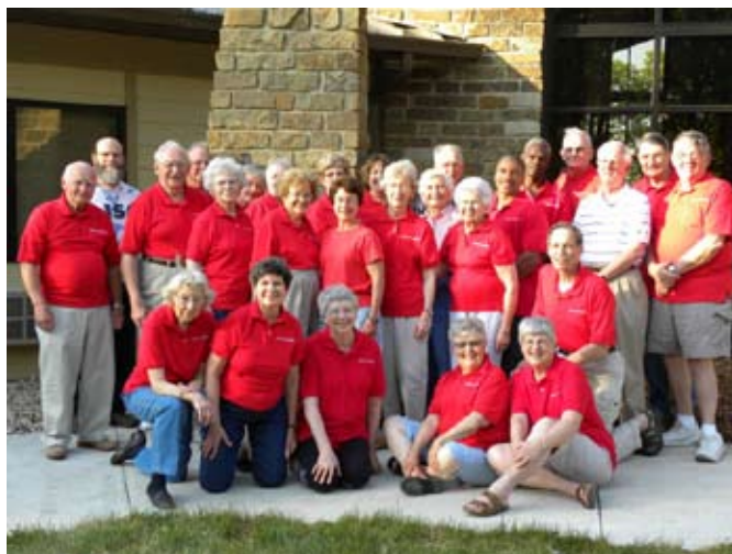
Mission Possible group.