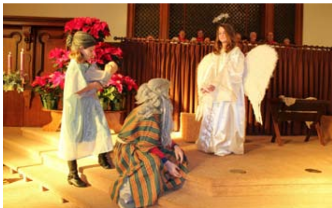
Youth act out parts in an "instant" Christmas pageant in worship on Sunday, December 23.

We do these things because we believe that God wants to communicate with each of us through prayer and that God really does answer prayer in his way and his timing.