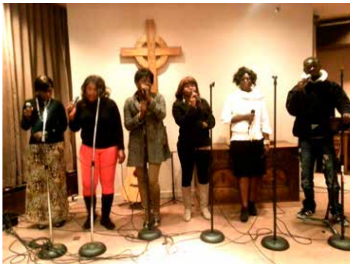
The Elect of God provide music each week for the Saturday evening Praise and Prayer Gathering.

In 2013, total revenues for the operating fund were $1,069,557, about 5.5% above the budgeted amount. This included $887,805 in pledged contributions and $106,756 in plate contributions, the latter a remarkable 30% above projections. Total expenses were $999,042 which was about 3.5% below the budgeted amount. Nearly all programs in the church were below budget. As a result of the restrained spending and the strong revenues, there was a year-end net balance of $70,514.