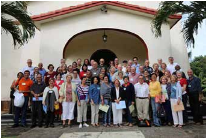
Members of our sister church in Luyana, Cuba with some of our Mission members.

At least once a year, there was a paid performance. We used the monies to purchase new music. Most of the music came from England, where hand bells have been popular for decades.