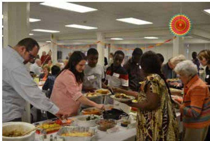
An International potluck was one of the many activities during Mission Week.

projects. We restated our commitment and focus on mission and developed a motto and value statement. These will guide our mission efforts for the next 3-5 years.