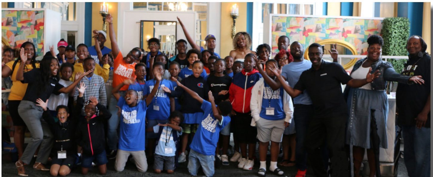
DREAM participants, parents and staff traveled from Champaign, Ill. to participate in Big Tent on August 2, 2019.