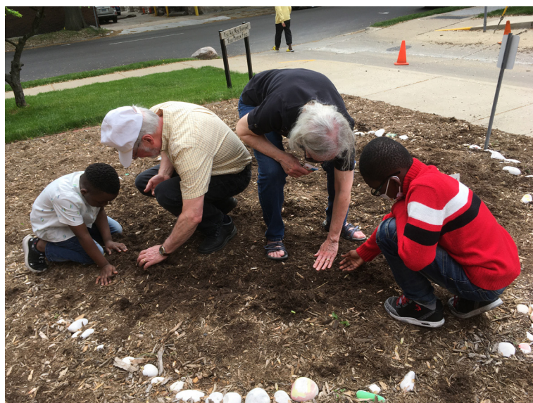
Members of Environmental Team had help from youth planting this year's pollinator garden.