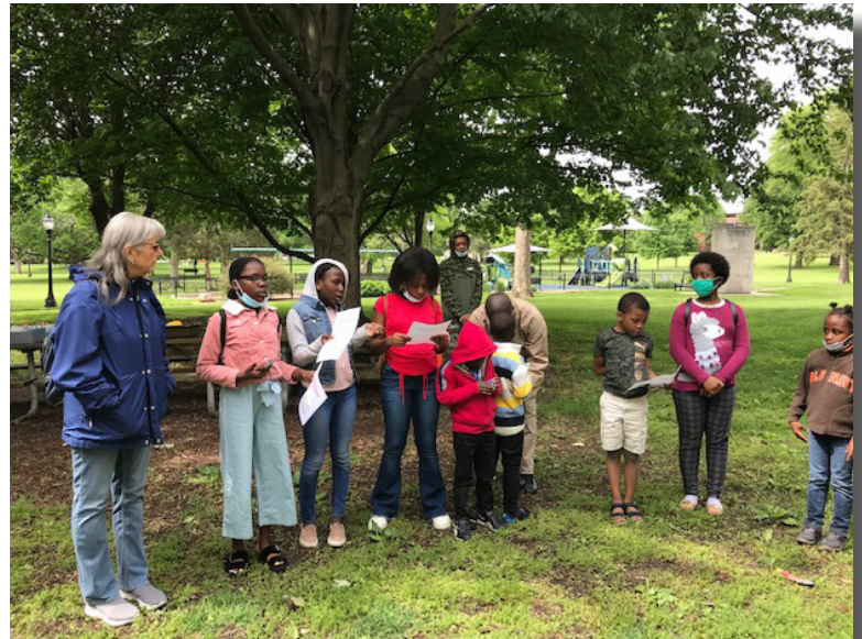
Sunday School enjoyed meeting outdoors in West Side Park when weather allowed.

The elementary aged children were using Growing in God's Love A Story Bible . Stories from this book and the corresponding curriculum were used beginning in the fall of 2020 and continued into the Spring semester. At home materials were mailed to some families that requested it, and a new webpage was created called First Pres Kids that was password protected. This allowed us to post a video recording of the images of the Growing in God's Love story pages while reading the story aloud. We also posted at home lessons that corresponded to the in-person lessons we were hosting for each