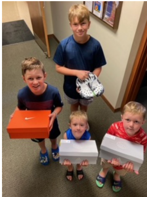
God is good!! The North boys brought shoes for DREAAM during the program's shoe drive for school-age youth.