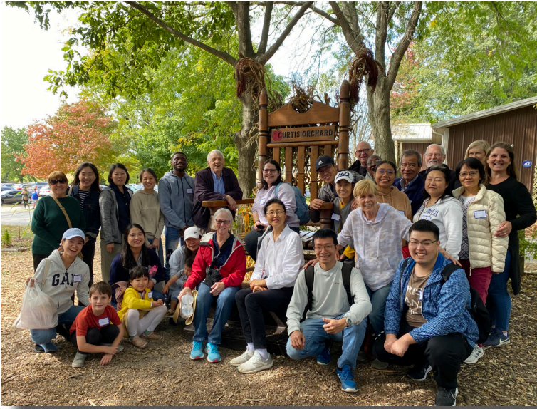
ELL students and tutors enjoyed a fall visit to Curtis Orchard.