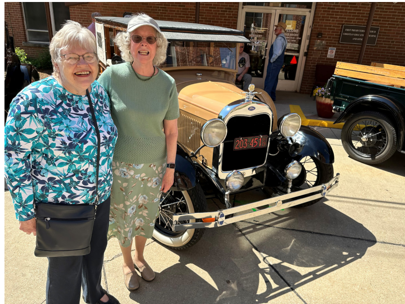
All enjoyed an antique car show after worship in May.

Committee members met monthly and worked with others in the congregation who did not attend committee meetings but who had significant responsibility for services within the committee's charge.