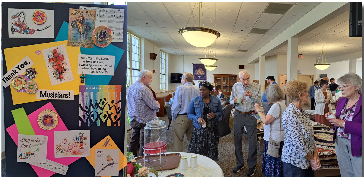
We shared our appreciation for our choir and music leaders during coffee hour last spring.