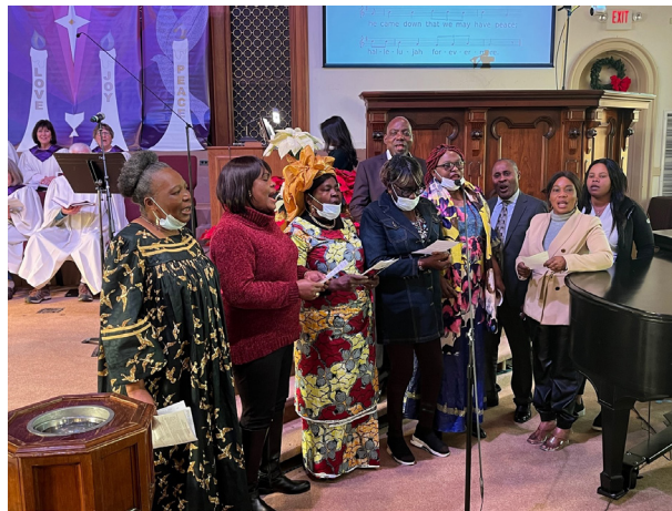
Easy English Fellowship shared their gift of song during worship.