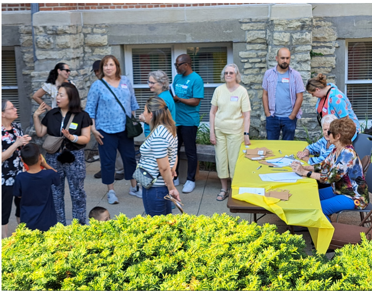
Members enjoyed good weather, good food and a good time at International Game Night in the fall.