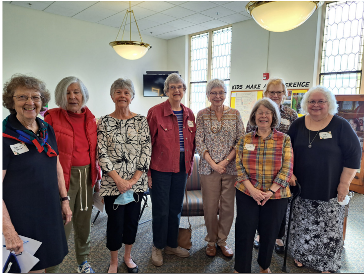
Our Presbyterian Women enjoyed several Gatherings throughout the year.