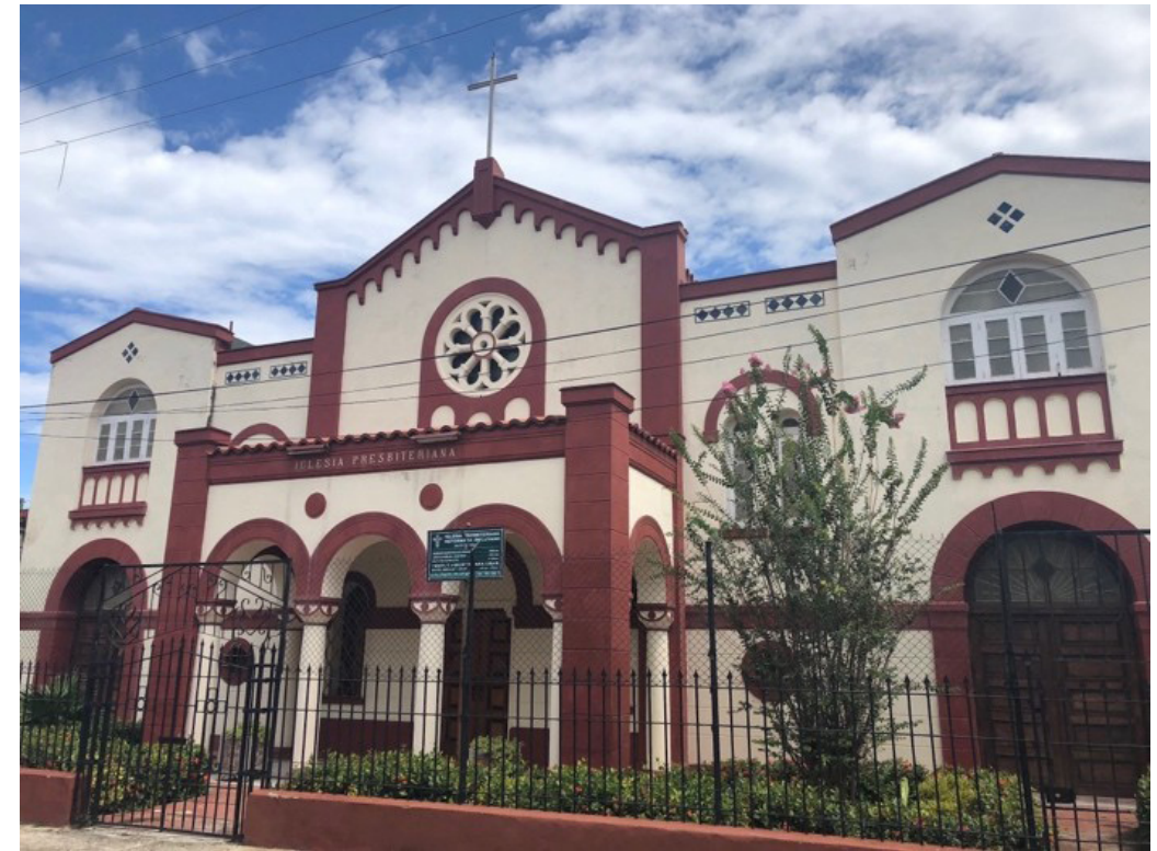
Our sister church in Luyanó, Havana Cuba.

May 17, 2026 7 th Sunday after Easter Cuba Sunday