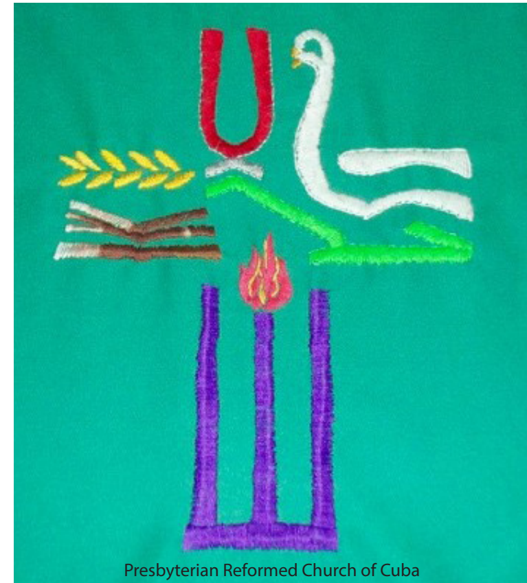
Presbyterian Reformed Church of Cuba

Welcome to First Presbyterian Church Bienvenue à La Première Eglise Presbytérienne de Champaign Bienvenidos a La Primera Iglesia Presbiteriana