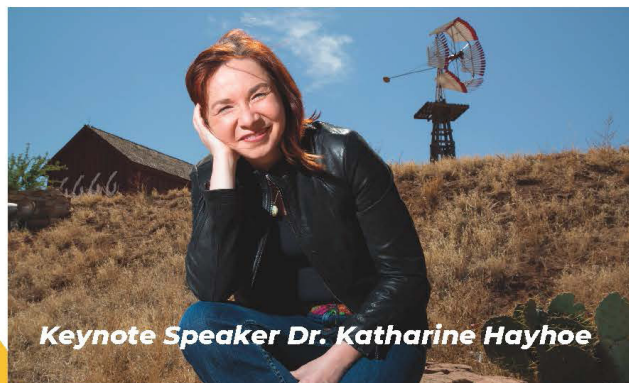
Keynote Speaker Dr. Katharine Hayhoe

First Presbyterian Church Champaign 302 West Church Champaign, IL