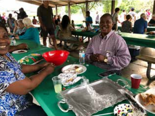
Sholem Fest Picnic in Centennial Park

Approximately 150 friends and family members attended Sholem Fest, our church picnic and pool party, on August 19. The party started with a picnic in Centennial Park, where we grilled hamburgers