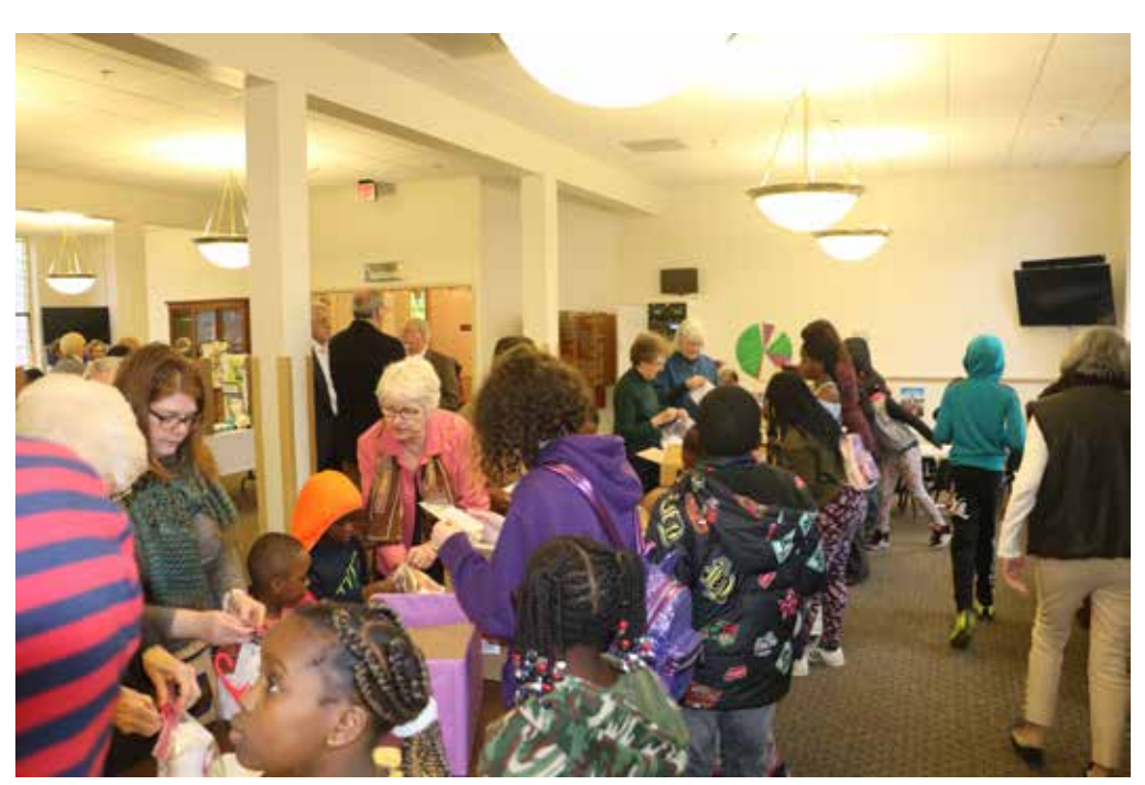
Youth and adults gathered in December of this past year to organize hygiene kits for local agencies.