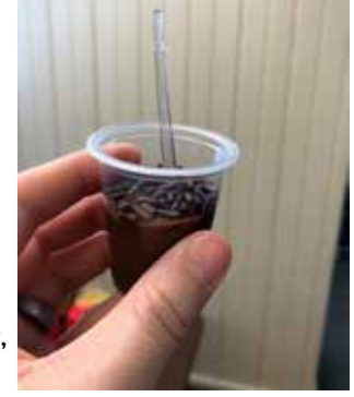
Brigadeiro (fudge) in a cup

special dance called frevo in which the dancers have little umbrellas that they use as props. In Salvador, during the parade, there are trio elétricos, or trucks with a high-power sound system