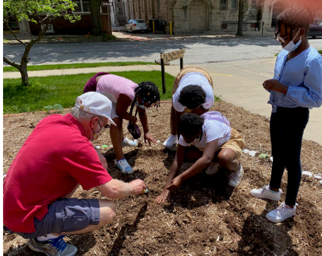
Planting the Peace Garden on Pentecost!